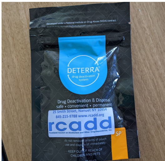
MEDICINE DISPOSAL BAG