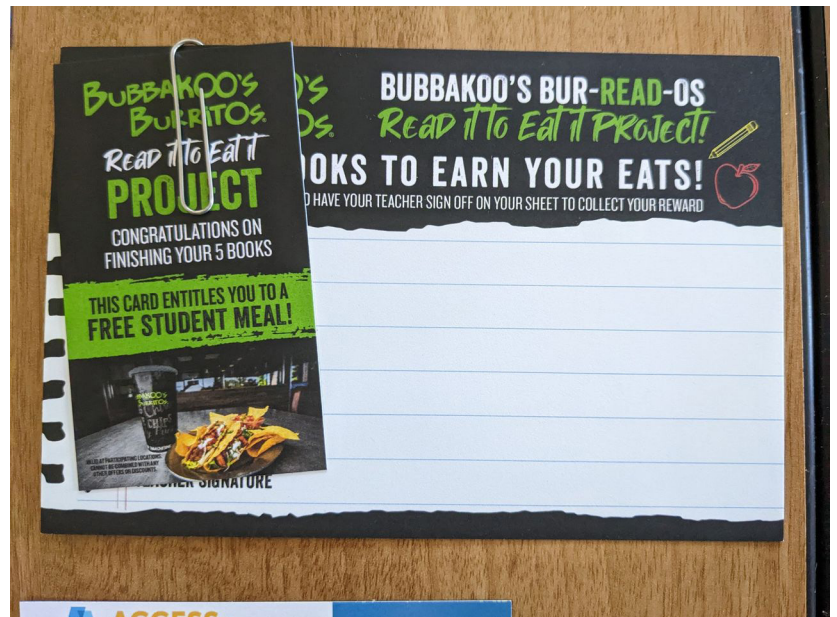
READING PROGRAM CONTACT OFFICE FOR DETAILS